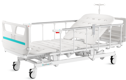
Safe working load